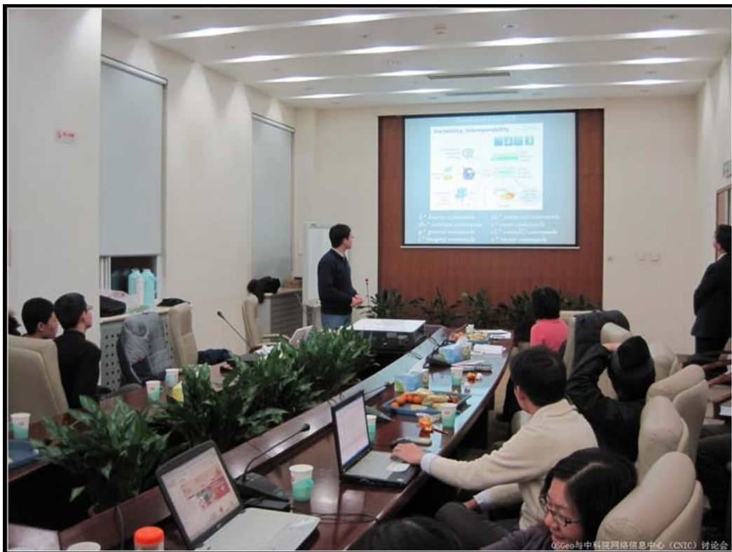
Fig.5 Workshop Organized by OSGeo China