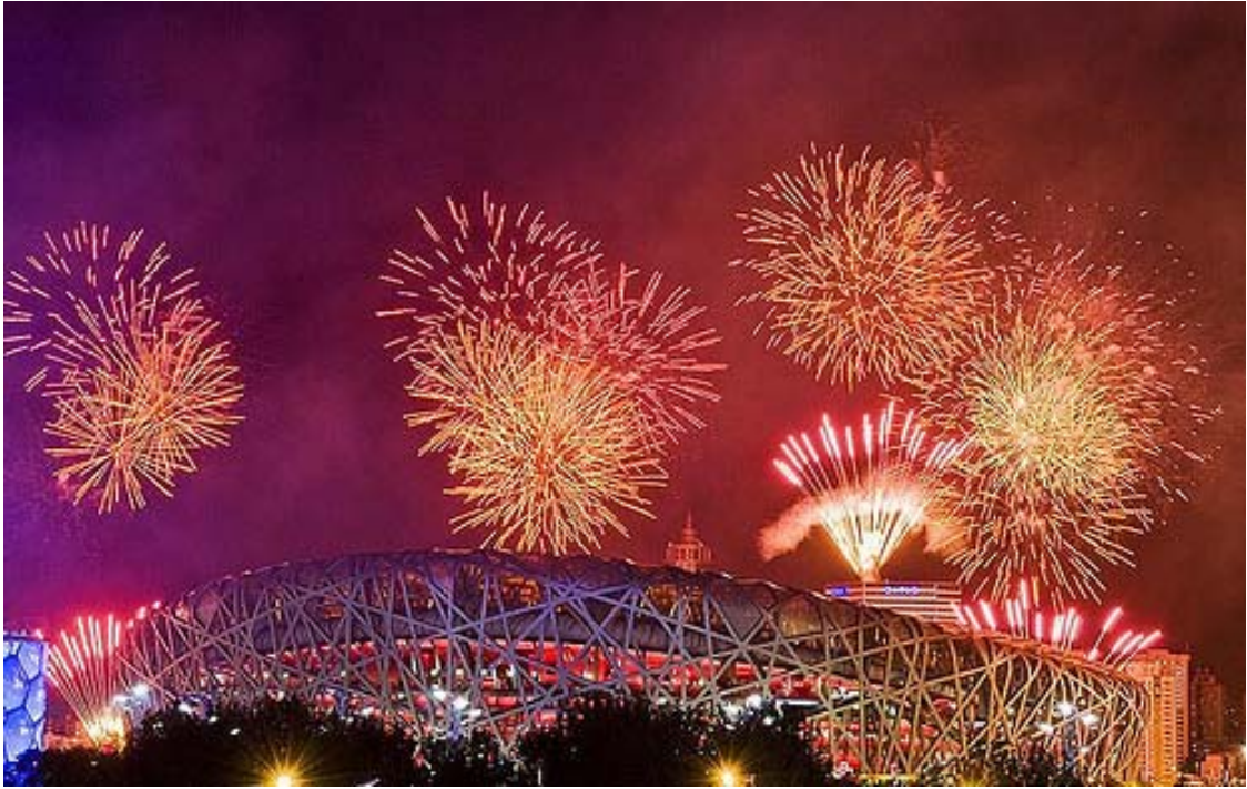
Fig.2 Olympic Opening Celebration in Beijing 2008

FOSS4G conference venue will take use of the facilities located at Beijing international conference center. Conference center sets inside the Olympic park, it will provide smooth, easy and rewarding conference planning process from start to finish. For a large conference hall (with 500-800seats) will cost about 36000RMB (around 5000$) for half a day. And the largest conference hall could contain about 1500 audience maximum.