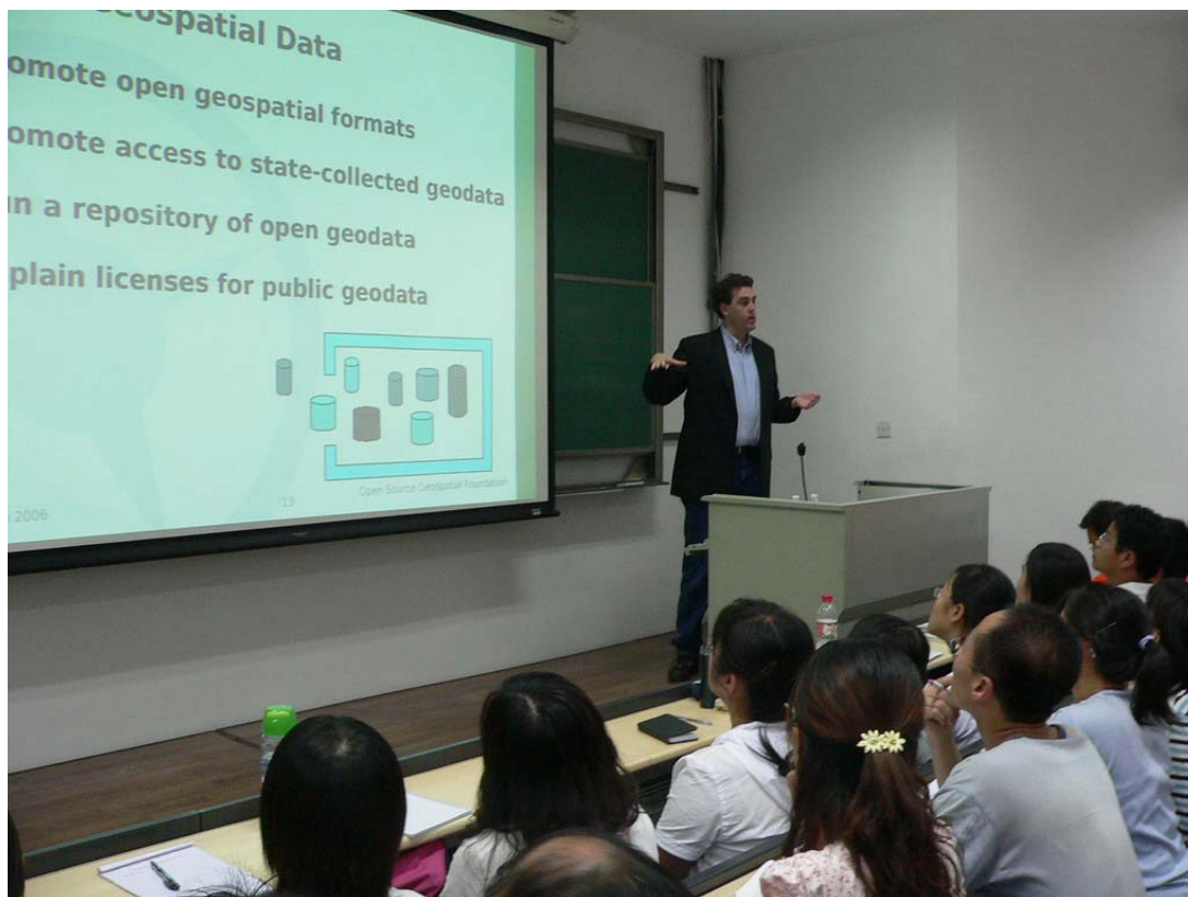
Fig.4 OSGeo delivers a speech for Chinese students

More and more open source communities from China pay lots of attention on GIS development. FOSS4G in China will also get support from local open source communities.