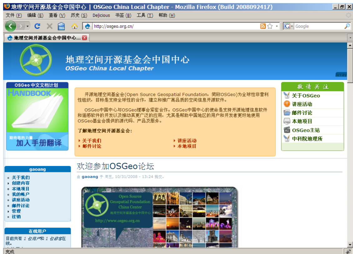
Fig.1 OSGeo China Local Chapter Website