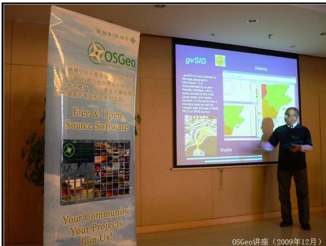
Fig.6 OSGeo China Lecture