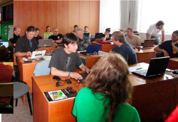
▼ Figure 2, GRASS GIS community sprint at Czech Technical University in Prague.