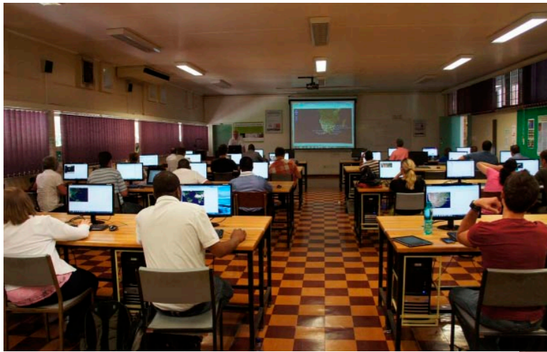
▲ Figure 1, Hands-on workshops at ICA-OSGeo Lab launch, University of Pretoria, South Africa (2012).

encourage the implementation of open standards and standards-based interoperability. Education is central to OSGeo's mission.