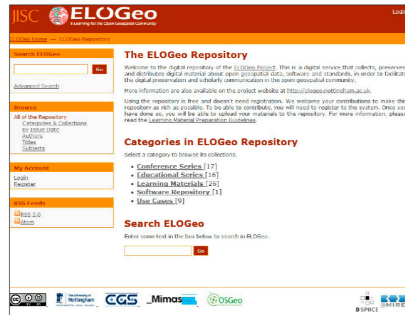
◀ Figure 4, Interface of the ELOGeo repository.

are encouraged to join the rapidly growing ICA-OSGeo Lab Network and contribute to the increasing global collective action. The key requirements for establishing an Open Source Geospatial Lab are: