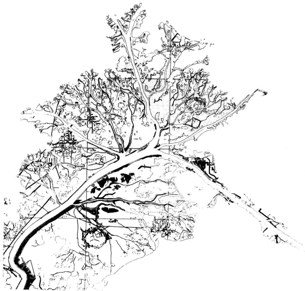
Figure 1. Mississippi River Active Delta as it appeared in 1956 and 1978.