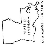
Figure 3. Oil spill protection priority index map.