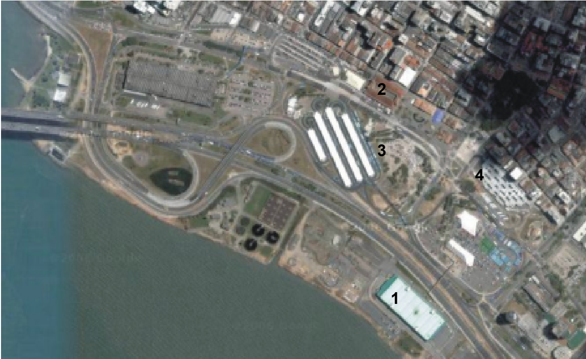
Figure 5: (1) Convention Centre; (2) Public Market; (3 and 4) Central Bus Stations.