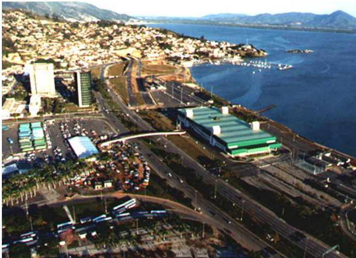
Figure 6: Northern view of the Convention Centre.