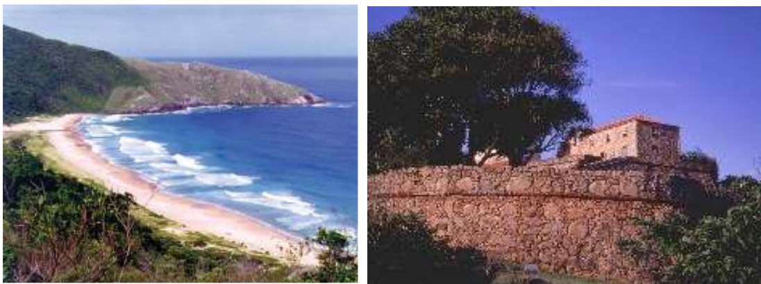
Figure 4: Touristic places: Lagoinha do Leste beach and Ponta Grossa Fortress.