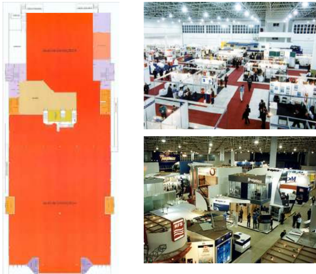
Figure 8: Ground Floor.

The ground floor has 2 salons with total area of 7.200m 2 . This space is intended for fairs, expositions and shows. It was designed for giving versatility and celerity when mounting and dismantling the equipments. Power and communication wires, as well as water tubes, are built-in into the floor. The system is adaptable for any need, saving time for event promoters.