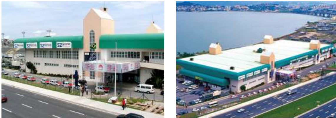
Figure 7: Detailed view of the Convention Centre.