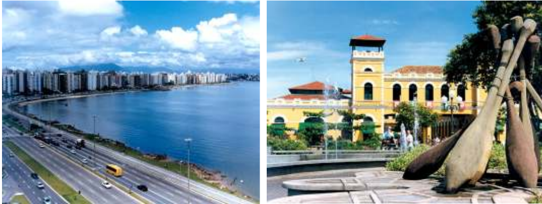
Figure 3: Touristic places: Long shore road and Public Market.