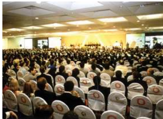
Figure 9: Upper Floor.