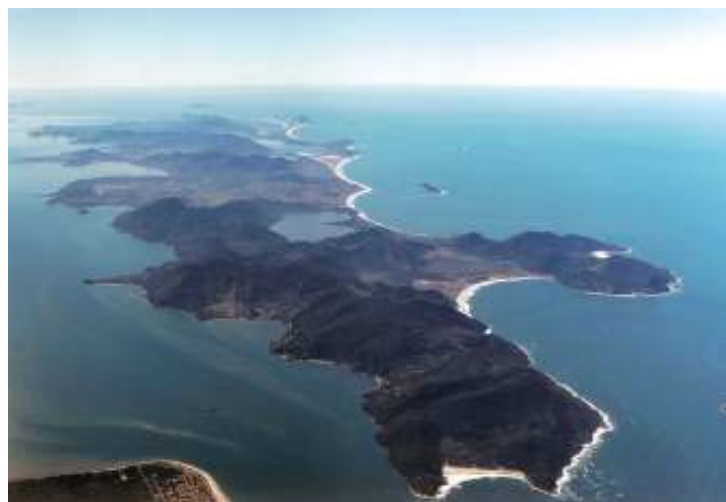
Figure 2: Touristic places: Santa Catarina Island and the Old Iron Bridge.